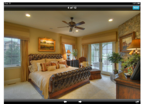
Photo Galleries & Email Sharing

This application is for subscribers of BrightDoor's BrightBase CRM solution and leverages the product inventory module to sync information and media. Limited customization of product attributes and search filters can be performed by BrightDoor. Please contact your BD Account Manager for details.